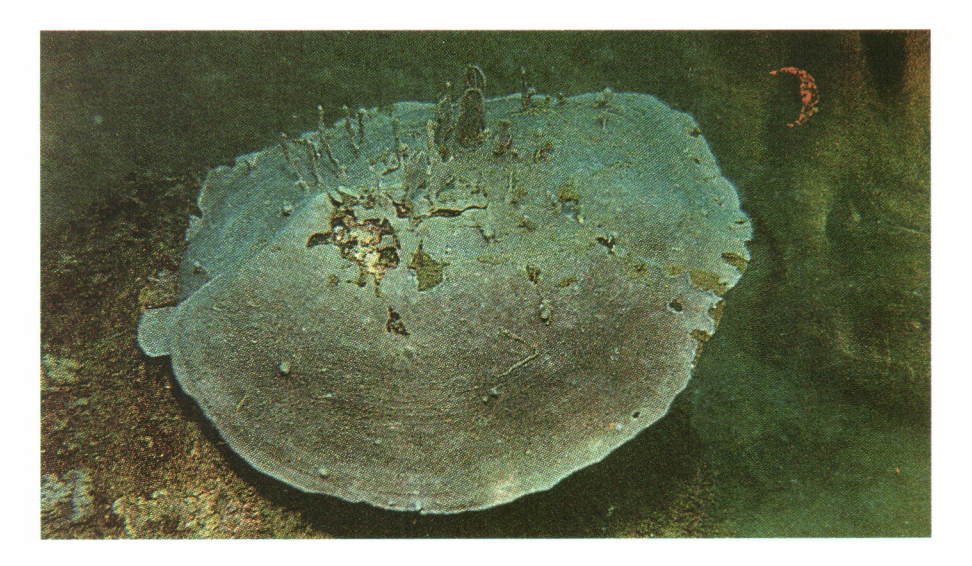
Figure 2. Halichondrida cartilagena

inhibiting the growth of Vibrio spp. C. pseudoreticulata (Figure 3) produces a bioactive material substances which is strongly inhibits growth of Aeromonas spp., Pseudomonas spp., and Enterobacteriaceae. Crude extract of Auletta spp. (Figure 4) actively restrains the growth of Acinetobacter spp.