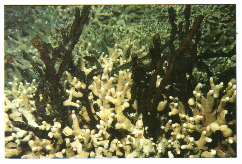
Figure 3. Callyspongia pseudoreticulata